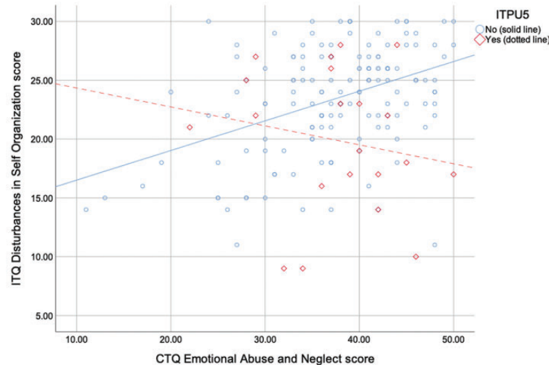
Figure 2. The moderating effect of ITPU5 on the relationship between EAN scores and DSO scores.

complex (but not simple) PTSS and internalized shame were significantly lower in the ITPU group, but FER accuracy did not differ between the ITPU and non-ITPU groups.